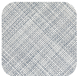
SQUARE 4.25" × 4.25" 10.8 × 10.8 cm

Unbacked coasters are also available in the majority of Chilewich fabrics. The MOQ is just 1 piece and pricing is a function of quantity, the more ordered the lower the cost. These can be made into 4"/10cm rounds or squares